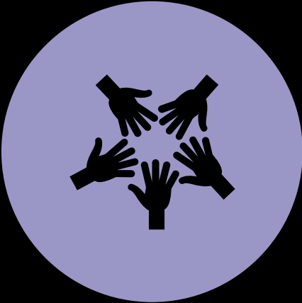
THE "WE" ASSOCIATION MEMBER