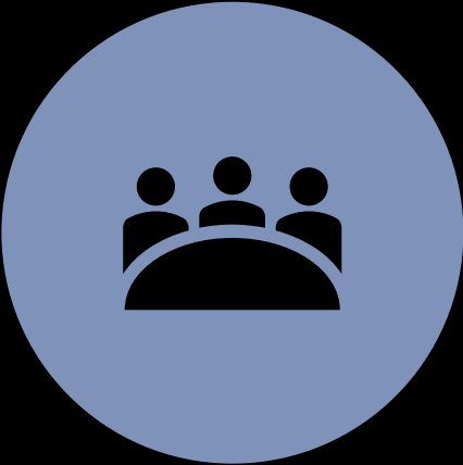
THE "ME" REPRESENTING OUR AGENCY